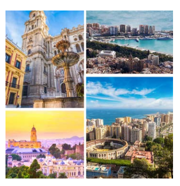
UNPAID INTERNSHIP €325