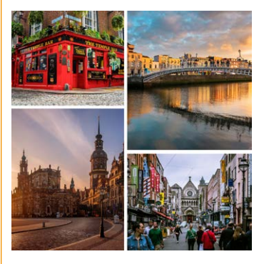
UNPAID INTERNSHIP €695